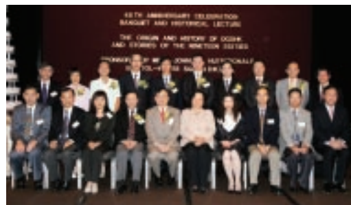
OGSHK Office Bearer and Invited Guests