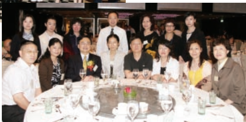
Delegates from China Attending This Symposium