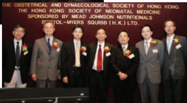
Speakers and Chairman for The Second Session