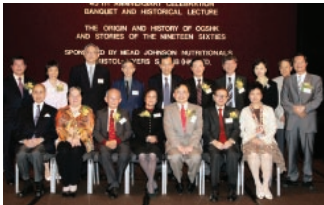
Past-Presidents and Past Council Members of OGSHK