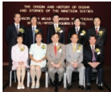
Current Council Members (2005-2007)