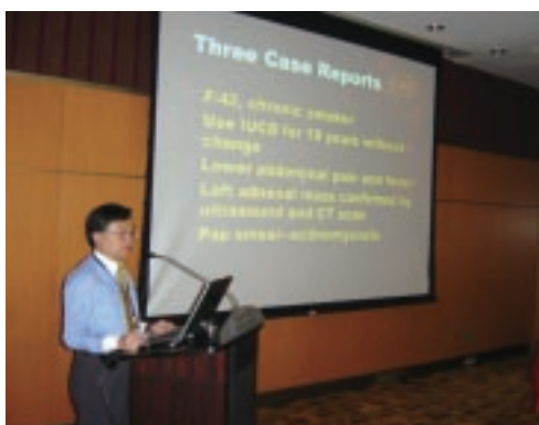
President Presenting a Free Paper in FIGO

Despite all these difficulties, may I wish you and your family a Merry Christmas and Happy New Year. Hope the best will come in the next year.