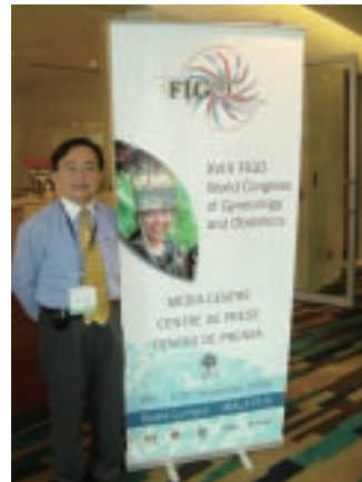
XVIII FIGO Meeting