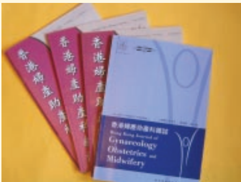
HK Journal of Gynaecology, Obstetrics and Midwifery

We plan to publish the next issue in February 2007. Doctors (specialists or trainees), nurses, and other healthcare professionals are invited to submit manuscripts which can be original articles, update articles, case reports or articles on continuous medical/nursing education. To facilitate the submission and review process, you may simply send us an email with attachment files (further detail available at society website www.ogshk.org ). We will promptly process your manuscript. Please support your local journal.