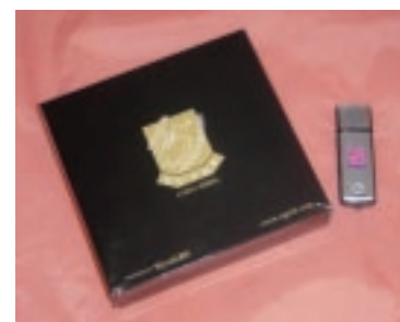
Souvenir for the 45 th Anniversary of OGSHK

To commemorate the 45 th Anniversary, we have published a special booklet called the "45 th Anniversary brochure of OGSHK" and a souvenir to all our members. The souvenir was a 512 MB USB drive with the OGSHK 45 th Anniversary logo printed on one side. Both the anniversary booklet and the souvenir should be given to each member and guest at the dinner on 12 th September 2006. For those members who were not present at the dinner, we have arranged sending both the brochure and the souvenir directly to your registered