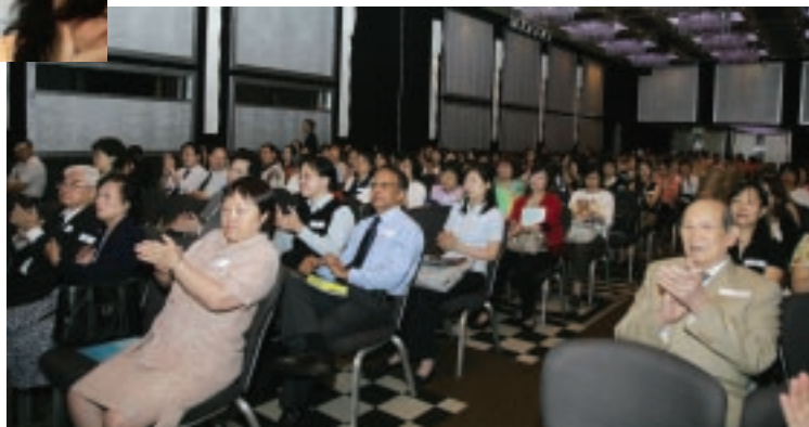
A Well Attended Perinatal Meeting on 14 th October 2006