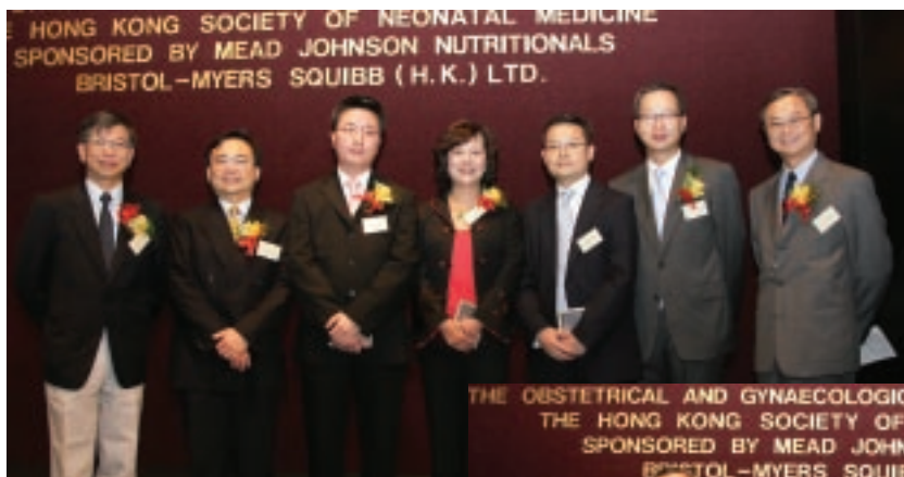
Speakers and Chairman for The First Session