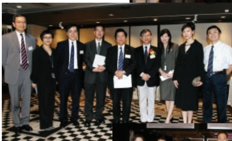
Office Bearers of The HK Society of Neonatal Medicine having Good Relationship with OGSHK